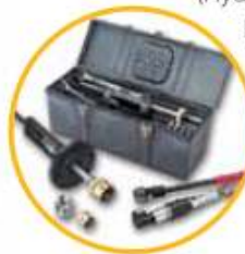
LR67 Drilling Machine