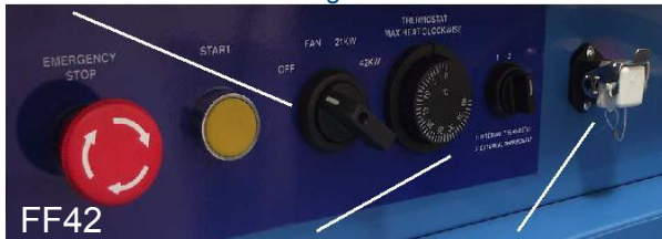
Thermostat Thermostat coupler