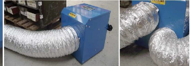
...with a series of spigot options available